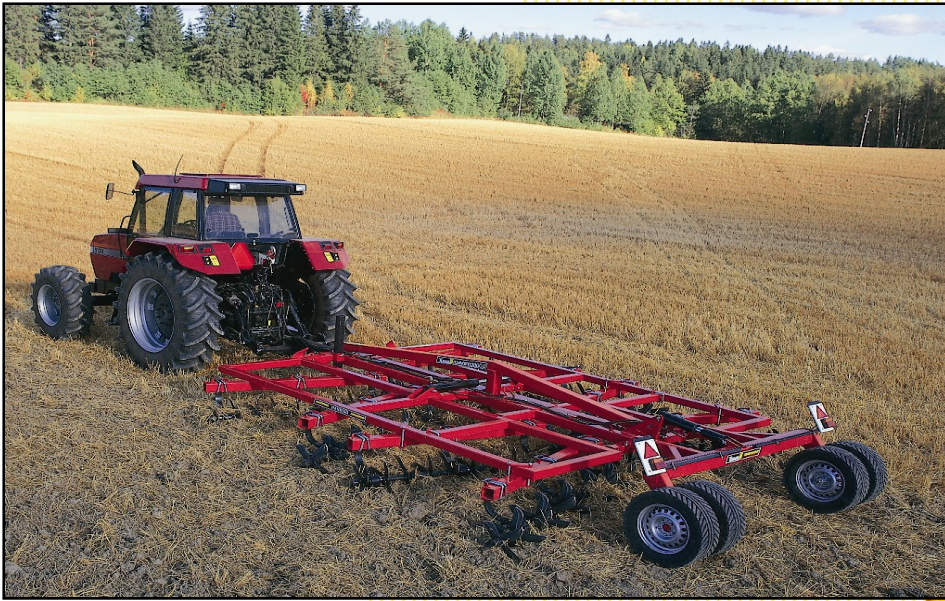
Trailed HANKMO 3800 S

Powerful autumn cultivation by three or four consecutive axles meets the environmental requirements of plant cover. Mulching and mixing of manure, compost and various soil materials into the soil goes efficiently and fluently by Hankmo. Even seed bed can be worked on stubble, ploughed land or minimum tillage. The long knife Hankmos can do a proper cultivation to a requested depth by a single pass. The work output is up to 10 hectares per hour with the biggest Hankmo models!