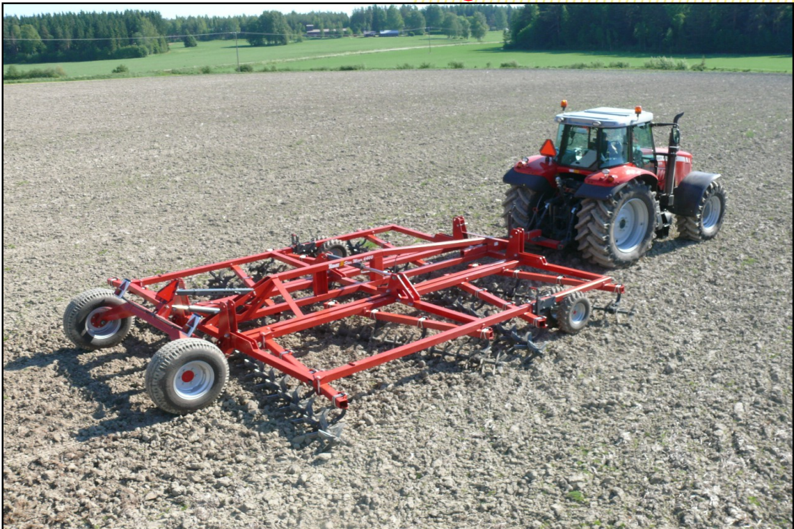
STARMIXER 6400 S