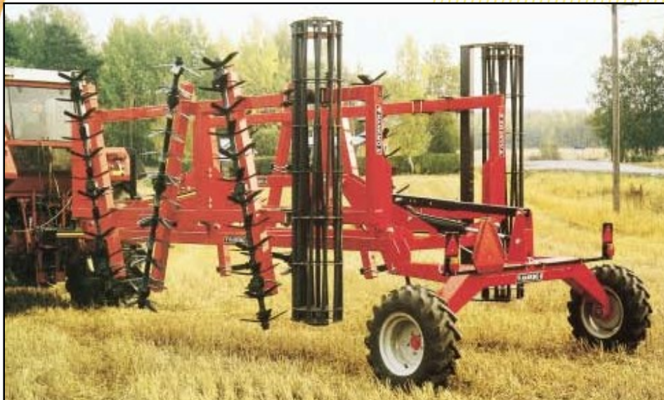
Hankmo 4600 S with packer roller