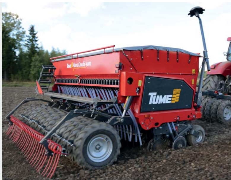
Hydraulic markers Grass seeders Rear harrow